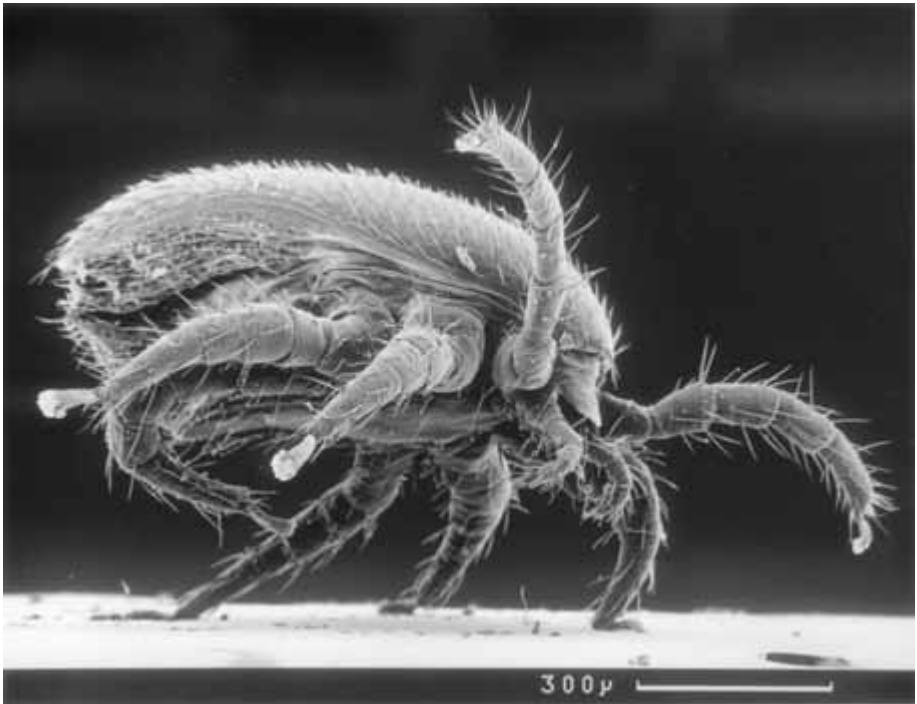
Fig. 1. Scanning electron micrograph of a lateral view of Tropilaelaps clareae showing the dorsal plate, peritreme, stigma (spiracle) and the sites of attachment of the legs.