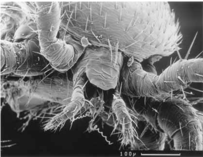
Fig. 2. Scanning electron micrograph showing the mouthparts of a male Tropilaelaps clareae . The movable digit of the chelicerae in the male appears as a long structure, coiled like a spring and lying between the pedipalps.